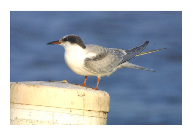
Common Tern September 20, 2001 Cross Lake, Shreveport