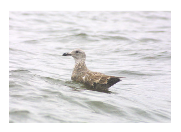
Lesser Black-backed Gull December 10, 2001 Cross Lake, Shreveport